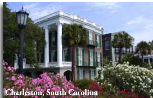
Charleston, South Carolina

Start with optional transfers from home or our departure points this morning to LAX for our flight arriving in Charleston, South Carolina this afternoon. The "Grand Dame of the South," Charleston is widely regarded as the most beautiful and historic city in America. Charleston is a place where delightful southern breezes and cobblestone streets pave the way to stately Antebellum homes and southern hospitality. The city is known for its magnificent formal gardens and its graceful historic district. After checking into our Charleston hotel, our home for the next three nights, we'll depart for an included dinner this evening. (Dinner)