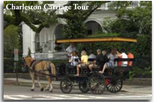
Charleston Carriage Tour

Afterwards, time to stroll the galleries and shops of the historic City Market. This afternoon we take a guided sightseeing cruise of Charleston's harbor and disembark at Fort Sumter . It was here on April 12, 1861 that America's most tragic conflict began with a single gunshot and through a chain reaction of social, economic and political events exploded into civil war. This afternoon, a visit to the Citadel , the Military College of South Carolina. An included dinner at a local favorite this evening. (Breakfast, Dinner)